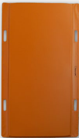
With handles # 5345 60 x 110 cm, orange/black # 5346 60 x 120 cm, orange/black

Framed welded treatment table pads with foam filling. Also available with handles for carrying anesthetized, weak or heavy animals.