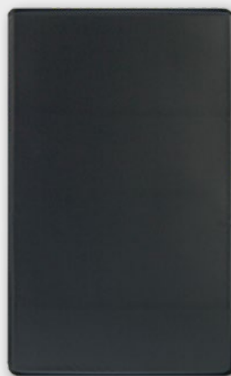
Without handles # 5347 55 x 115 cm, black/black # 53471 55 x 125 cm, black/black # 53472 60 x 120 cm, black/black