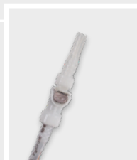
# 90148 CPC Inline Valve