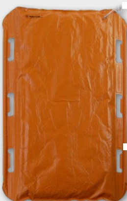
# 5931 60 x 110 cm, with four handles # 5932 60 x 115 cm, with six reinforced handles # 5938 65 x 115 cm, with six reinforced handles # 5933 75 x 115 cm, with six reinforced handles # 5934 85 x 125 cm, with six reinforced handles

Serve to stabilize the animal during surgery, providing safety, comfort and pressure relief. For very heavy animals with reinforced handles.